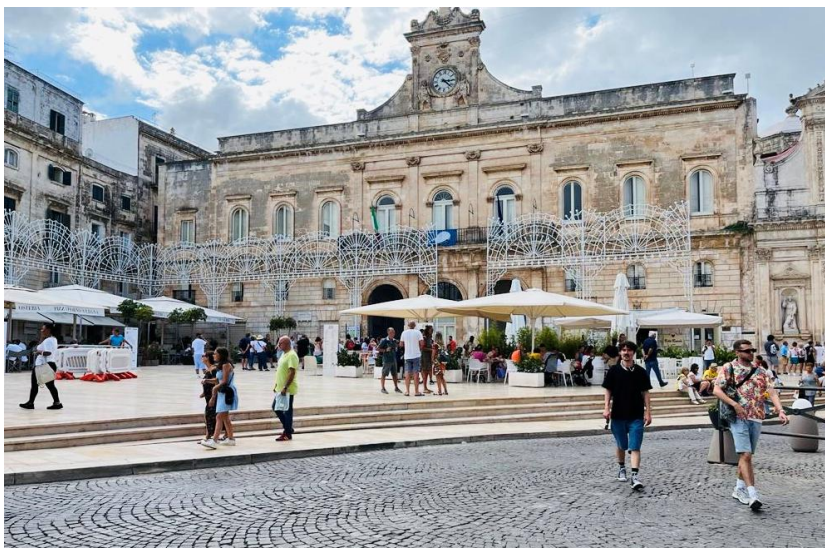
Main Square in Ostuni

Both airports have direct flights from Bristol , making travel easy despite the rural feel.