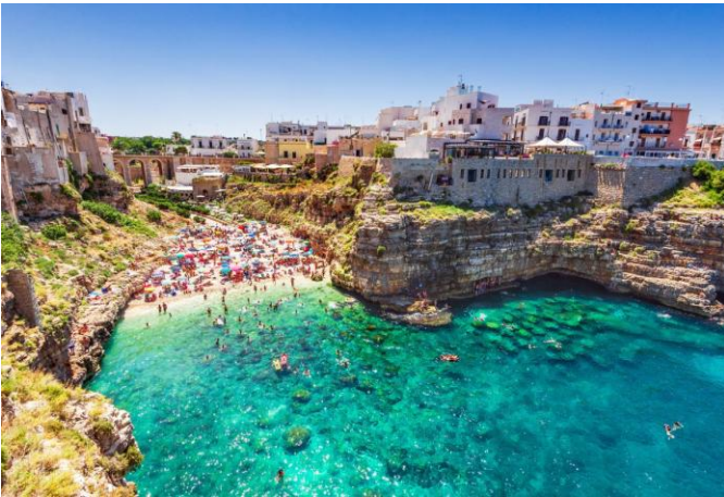
Polignano a Mare